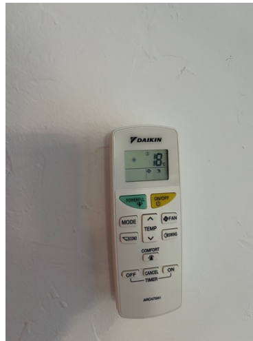
Symbol for HEATING: ☀️ (sun)