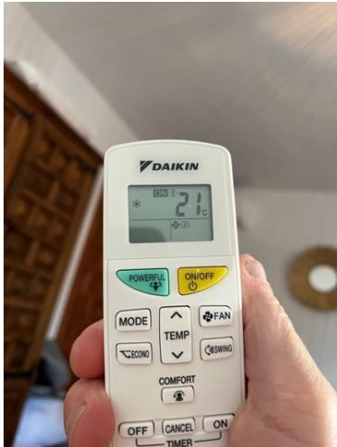
Symbol for: COOLING: ❄️ (freeze)

Don't forget to turn airco off when sleeping or early in the morning!!